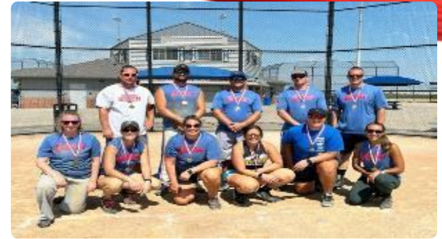
2023 Winning Team

This program is designed for men and women to form teams for a game of softball. Games will be played on Monday evenings July 1— August 19, 2024 at the Pella Sports Park. Games at 6:00, 7:15 and 8:30 pm. There will be two separate leagues: B (competitive)* will play on fields 4 & 5 and C (recreational)* will play on fields 2 & 3. A single elimination tournament will be held Saturday, August 24, 2024, for both leagues.