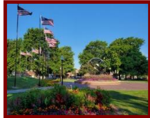
Parks Maintenance, 641.628.4299

The City of Pella provides many recreational opportunities for youth and adults alike. From open green spaces that allow you to create your own way of play, to structured sports programs for teams, the Community Services Department will meet your recreational needs.