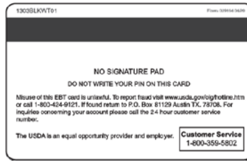
Card front and back