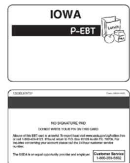
P-EBT card front and back

If you have a child who is eligible for the Free and Reduced Price School Meals, the P-EBT benefit will be mailed to the address on file with the school district.