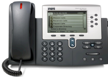
Office Phone Replica

A frequently asked question by students in the Middle School office: “Can I call home?” Although perhaps not surprising, what may surprise you is how many of these students are not familiar with using a landline phone (some may refer to it as an old fashioned phone!). Although many homes are getting rid of their landlines, most businesses still operate with some form of a receiver and separate dial pad. If you have a landline at home, check with your kids to see if they still remember how to dial a phone the old fashioned way! Happy dialing!